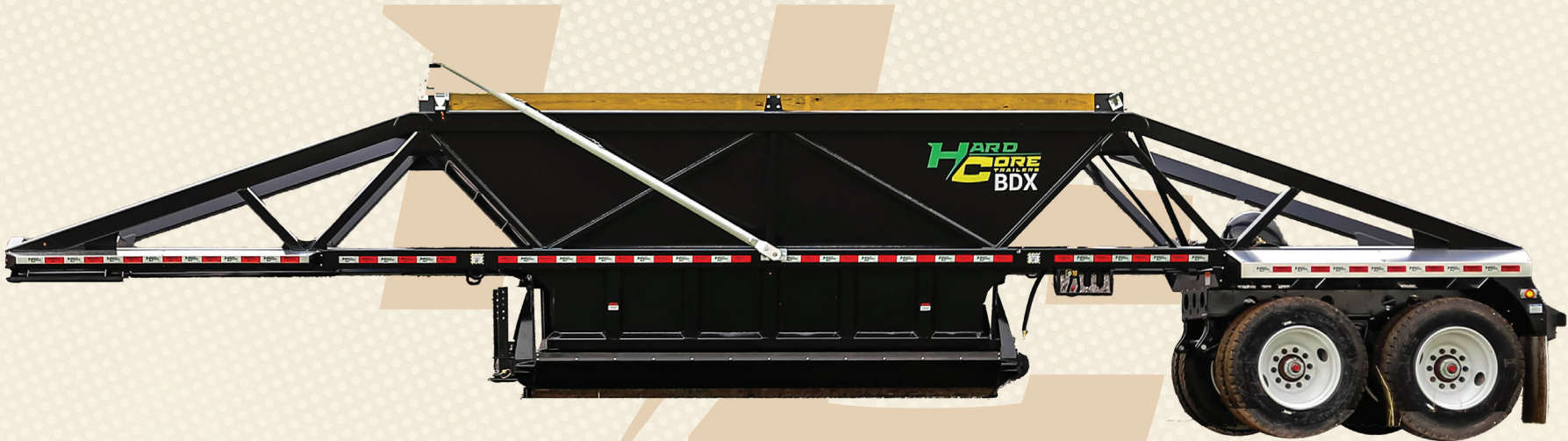
ACTUAL PRODUCT MAY VARY FROM PICTURE

LIGHTS: DOT APPROVED LED SEALED LIGHTS, FULLY ENCLOSED CONDUIT WITH JUNCTION BOX ABS: SENSORS ON REAR AXLE PUSH/PULL BLOCK: BOLT ON PAINT: POWDER COAT